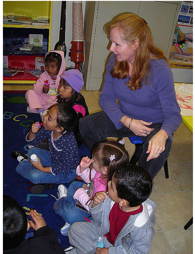
You could be this teacher!

Working with Preschoolers. Do you know how much fun it can be to work with three-, four-, and five-year-olds? In ABC Playtime, SMUM provides a program to about 12 preschoolers, and two volunteer teachers work together at each session.