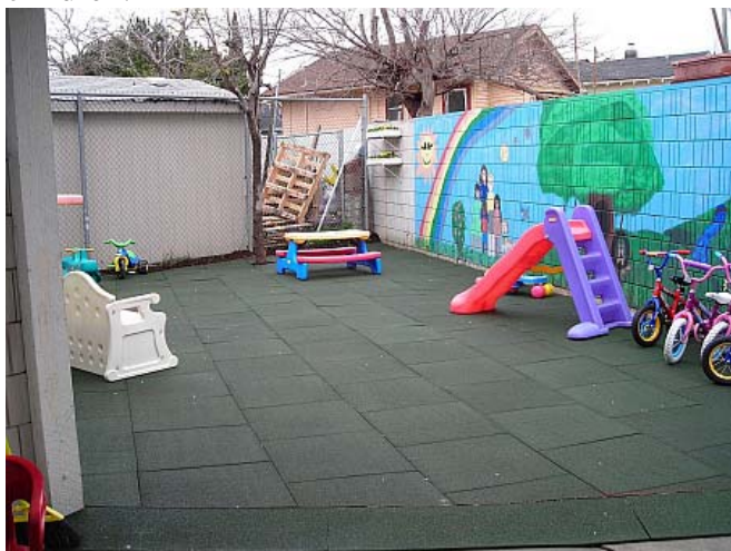
New safe surface for ABC kids

The ACE workers also painted the reception area, hall and kitchen; and installed new, safe rubber tiles on the outside play area for the ABC Playtime children.