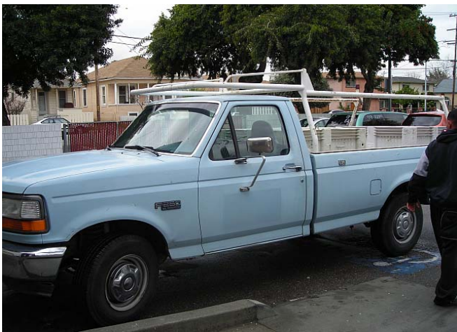
You could be driving this truck!

What else do you do? The items are loaded at Second Harvest, then you drive back to Santa Maria, help unload the items, and you're finished. All you need is a regular driver's license, time, and the selflessness to say, "I'll help!"