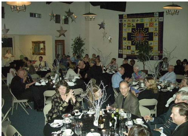
St. Tim's dinner.

On 17 October 2009, St. Timothy's Episcopal Church in Mountain View held "A Feast of All Things Chocolate," a fund-raising formal dinner and auction to benefit SMUM.