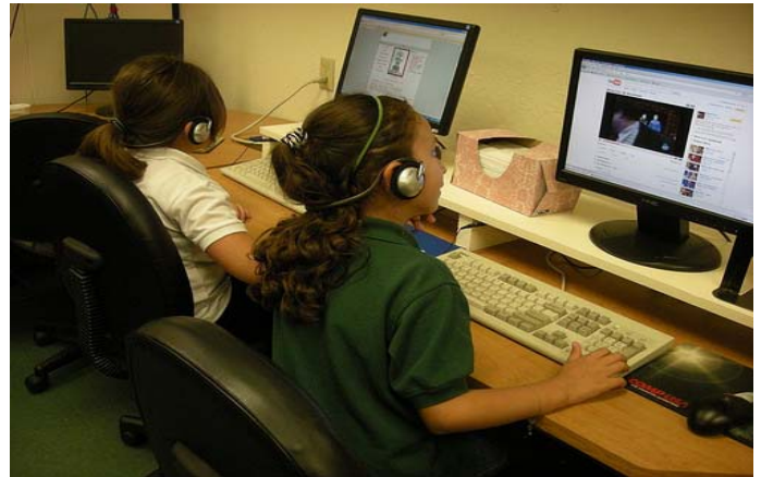
Some of the Studio 17 kids at work in the lab.