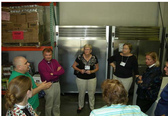
Team members tour the SMUM warehouse.